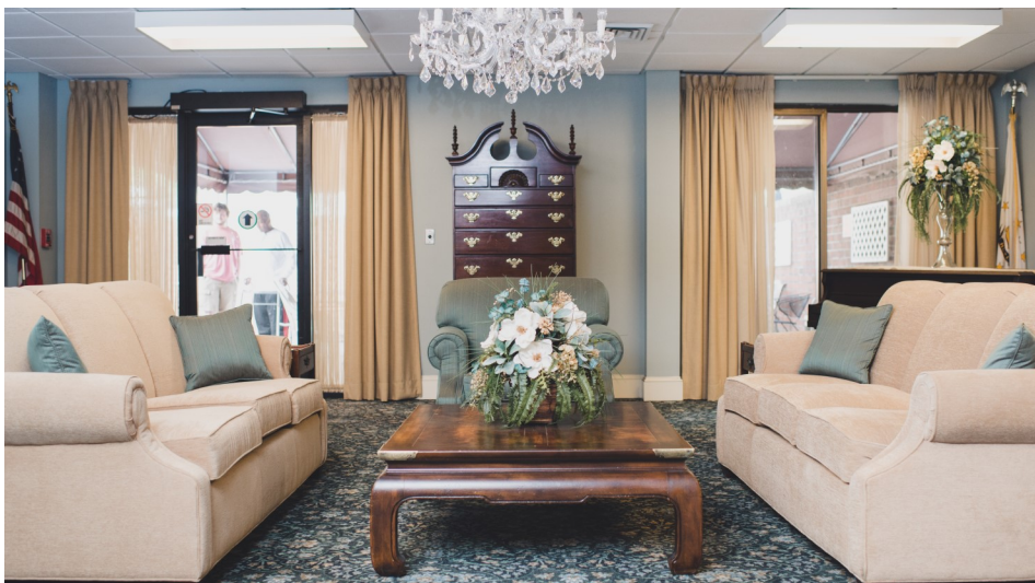
Charlesgate Nursing Center

“Charlesgate provides convenient and affordable apartment living, skilled nursing care and assisted living combining personal service and quality health care from a staff of dedicated professionals.”