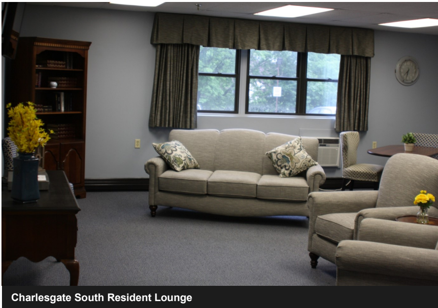
Charlesgate South Resident Lounge