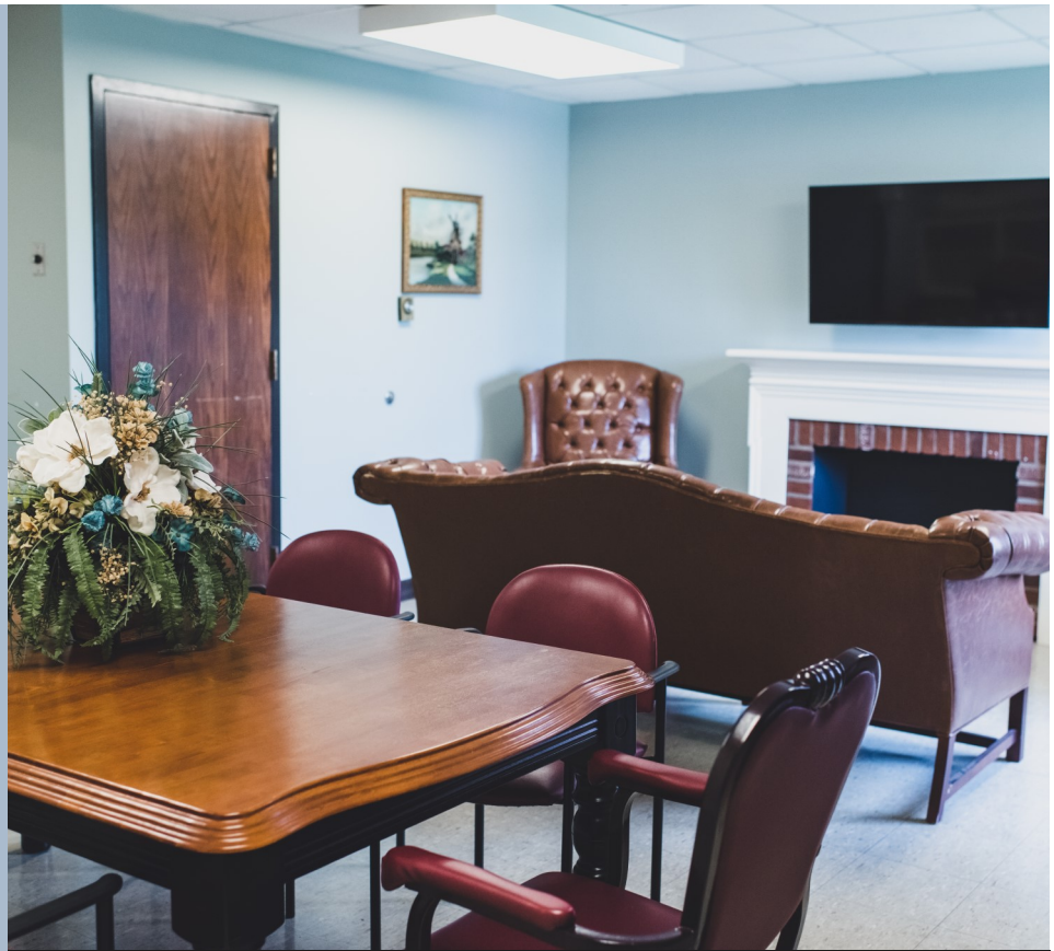
Resident Library at Charlesgate Nursing Center